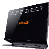
KW58283 ADSL2+ Modem Router

Internal 2T2R 1* DSL port 4 *Fast LAN port 300Mbps Wi-Fi Speed