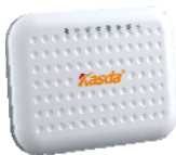
KW58293 ADSL2+ Modem Router

Internal 2T2R 1* DSL port 4 *Fast LAN port 300Mbps Wi-Fi Speed