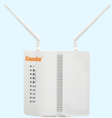
KW5262B VDSL VoIP Gateway

External 2T2R 1 *USB2.0 2 *FXS Ports 1* DSL RJ-11 Port 4 *Fast LAN port 300Mbps Wi-Fi Speed